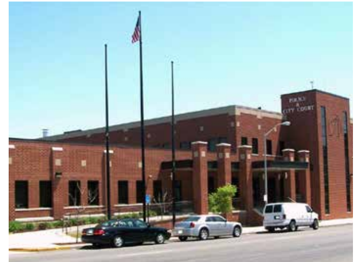
Police & City Court

The city also has police and fire departments and an Emergency Management Department that coordinates and utilizes existing city personnel and facilities to prepare for and meet any emergency that exceeds the demands of standard operating procedures.