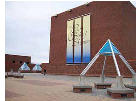
Crane School of Music, SUNY Potsdam