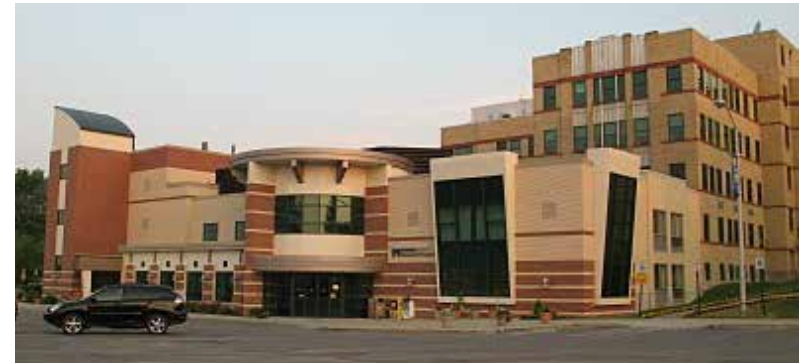
Massena Memorial Hospital

Massena Memorial Hospital, located at One Hospital Drive in Massena, provides high-quality healthcare, administered by a team of professionals in a caring, compassionate, efficient and ethical manner that promotes the health and well-being of the local community. From the quality and cleanliness of a patient's room and the consistency of meals served to the level of medical care received, the professionals at Massena Memorial Hospital pride themselves in delivering inpatient services in a highly personalized manner that considers the specific needs of each patient. Massena Memorial Hospital also is affiliated with Fletcher Allen Health Care, a teaching facility in Burlington, Vt., and Upstate University Hospital in Syracuse, NY.