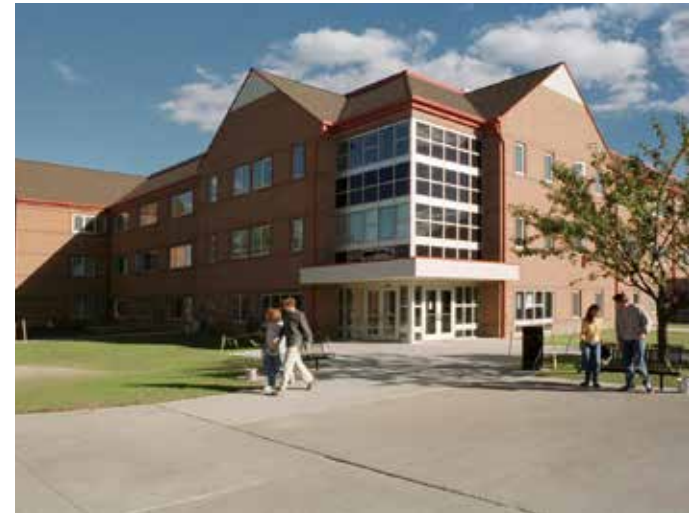
Saginaw Valley State University

The City of Saginaw is served by the Saginaw Public School District ( www.spsd.net ). The district operates 10 elementary schools, one middle school and three high schools. Michigan Lutheran Seminary ( www.mlsem.org ) is the lone private high school in the city. Charter schools in the city are North Saginaw Charter Academy, Saginaw Prep schools and the International Academy of Saginaw ( www.ias-sabis.net ).