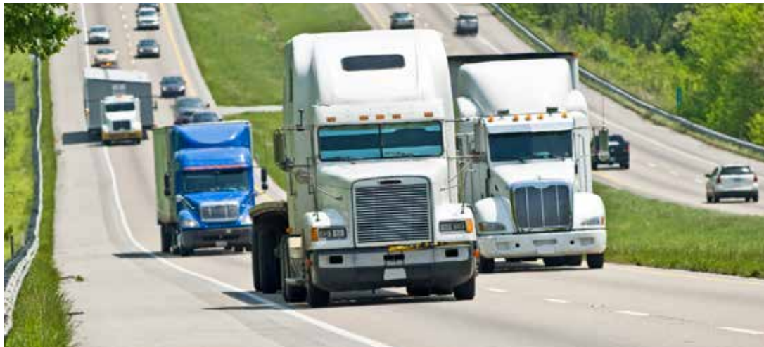
*Information obtained from RACER research.

Bay County's inter-modal transportation infrastructure can assist any business in servicing the world.